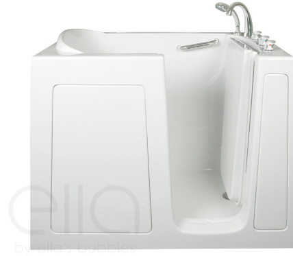
305213R Right Hand Door and Drain

Actual Size: 30" W x 51.5" L x 41" H Shipping Size: 31" W x 52" L x 42" H Shipping Weight: 270 lbs. Net Weight: 215 lbs. Water Capacity: 90 gal. US (unoccupied) 55-75 gal. US (occupied)