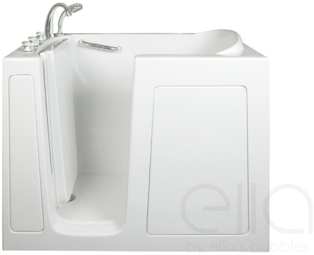
305213L Left Hand Door and Drain